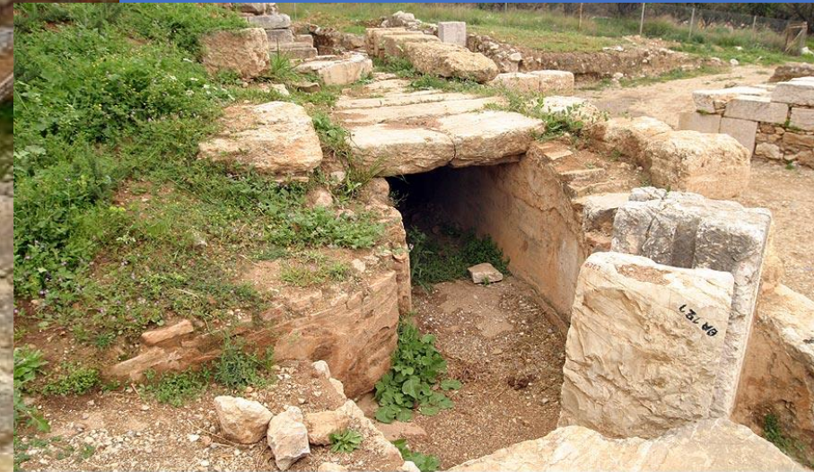
The Hellenistic Theatre at Argos, Greece - Photo: T. Hines 4/10/2004 The orchestra features an underground passage (Charonian stairway or Charon's steps) for use by the chthonic deities. It is one of only two verifiable sets of such steps (the other at Eretria), and the lack of verifiable sets in other surviving theaters seriously calls into question Pollux's assertion that these steps were "a standard feature of Greek theatre rather than occasional oddities" (Ashby 11).